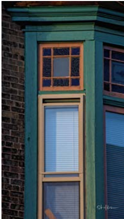
My owner was the chief of staff at Waukesha Memorial Hospital: