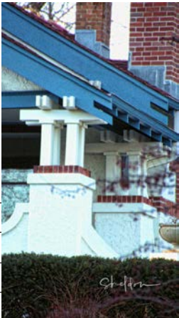
The family of my owner donated the building for the YWCA: